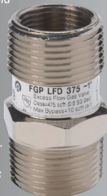
"LFD" Series Meter Valve Intended for use with Fuel Gas (Natural Gas, Propane and mixtures)