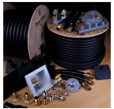
TRACPIPE® COUNTERSTRIKE® TUBING