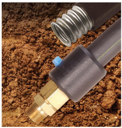
TRACPIPE® PS-II TUBING